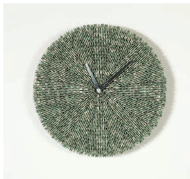
"Money clock", 2013 8 pieces + 2 A.P. + 2 prototypes 23,6 in. (60 cm) x 3,7 in. (9,5 cm)