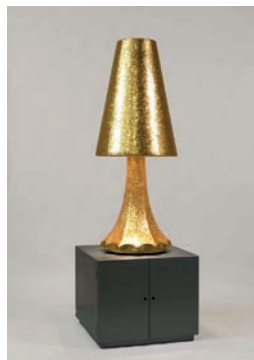
"Lampada", 2002 12 pieces + 1 prototypes 65 in. (165 cm) x 31,5 in. (80cm) 26 in. (66 cm) x 91 in. (231 cm)