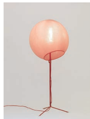
"Frozen lantern", 2010 8 pieces + 2 A.P. + 2 prototypes 68,9 in. (175 cm) x 28,7 in. (73 cm)