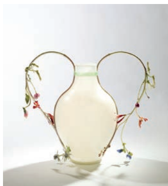
Big Frozen Vase, 2010 20 pieces + 2 A.P. + 2 prototypes 18,9 in. (48 cm) x 20,4 in. (52 cm) x 2,3 in. (6 cm)