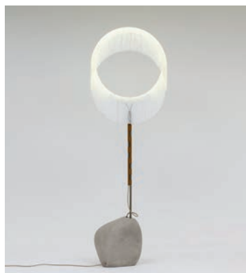
"GI" (Right decision), 2013 6 pieces + 2 A.P. + 1 prototype 95,5 in. (242,5 cm) x 31,5 in. (80 cm) x 11,8 in. (30 cm)