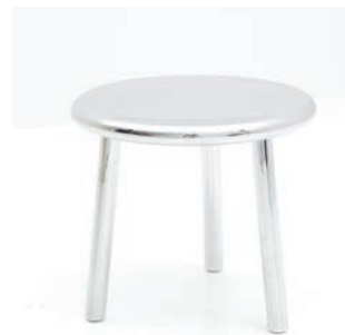
"3-LEGGED" Stool, 2007 8 pieces + 2 A.P. + 2 prototypes 12,9 in. (33 cm) x 14,9 in. (38 cm) x 12,5 in. (32 cm)